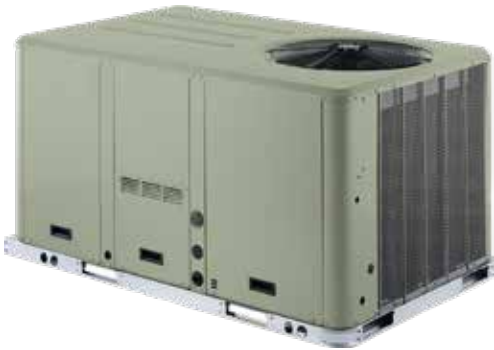
Light commercial units up to 25 tons